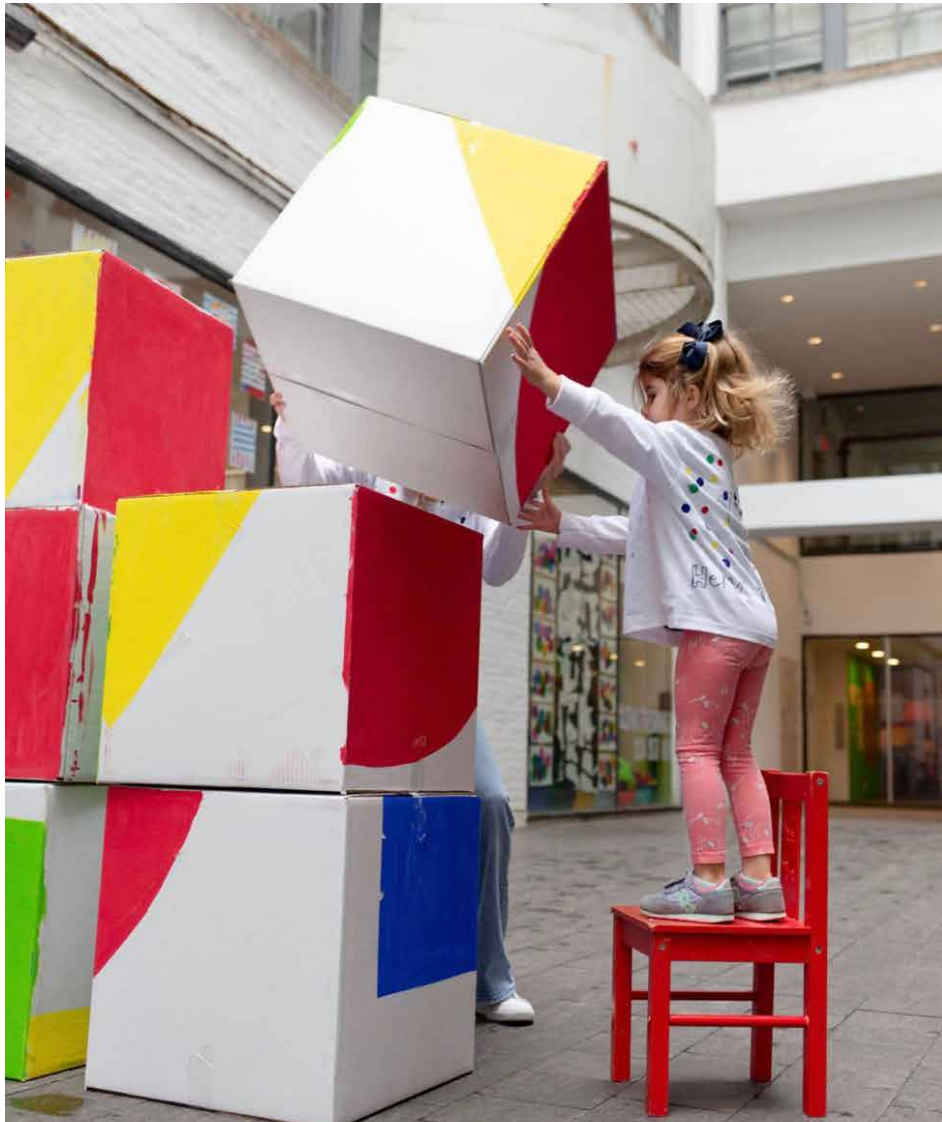
Les Beaux Arts