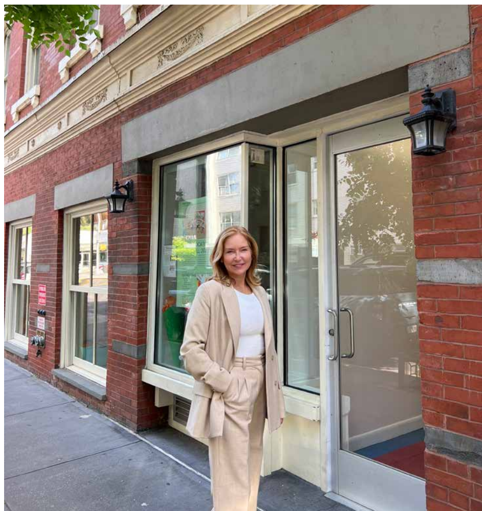
New Location on West 10th Street