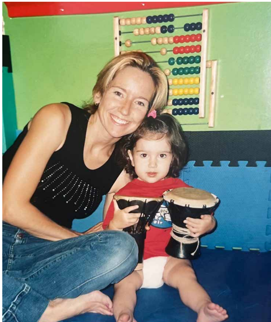
Perry Street 2002